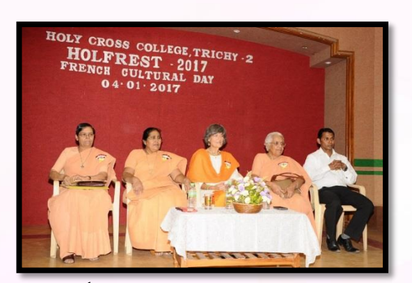
On 4<sup>th</sup> January 2017, the department of French conducted "Holfrest 2017 – French Cultural Day", an inter-departmental

On 17<sup>th</sup> September 2016, the department of French organized a study tour to Kodaikanal for the French students. After they refreshed themselves and had breakfast in Holy Cross Convent, they saw the lake view from uphill. Then they visited some of the important tourist spots such as pillar rock, botanical garden, lake, ever green valley or suicide point, coakers walk, park and silver cascade. They took photos. Huge trees and mighty valleys were a feast to the eyes. They visited a museum of variety of birds, snakes, butterflies, animals, stones, bones, pots, the life of hill people and coin collection. They enjoyed the trip to the maximum. It was a wonderful day. Based on this experience, they get a creative writing question for 10 marks in the second internal examination. The exciting and refreshing experience and memories will linger on in their memory.